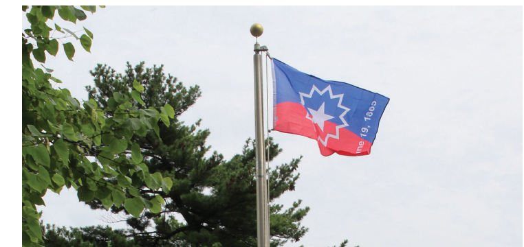
The Juneteenth flag is rich with symbolism, including the white star which is a nod to Texas, where Juneteenth was first celebrated in 1865.

Other activities included a Juneteenth flag-raising ceremony, singing, dancing, and drumming performances, as well as lunch, games, and crafts.